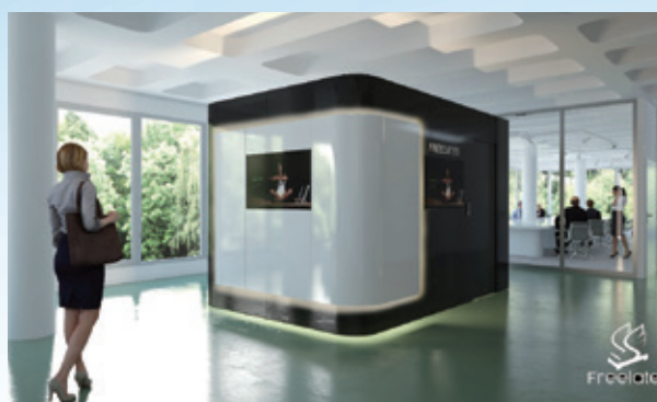
Freelates unit exterior