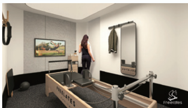
Interior of a Freelates unit, a professional and designed Pilates equipment environment