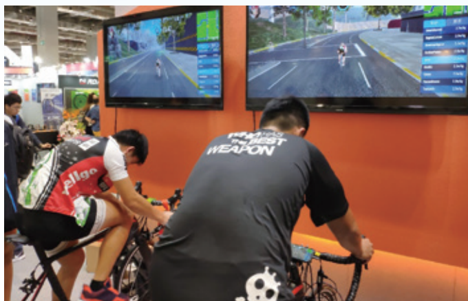
Individual training, event competition, team training, arranging group rides; no need to worry about time or the weather, WhiizU lets you train when you want.

The inbuilt training modes have FTP and ERG as well as various professional courses and fitness modes. Users can compete online and organize group rides; personal data will be