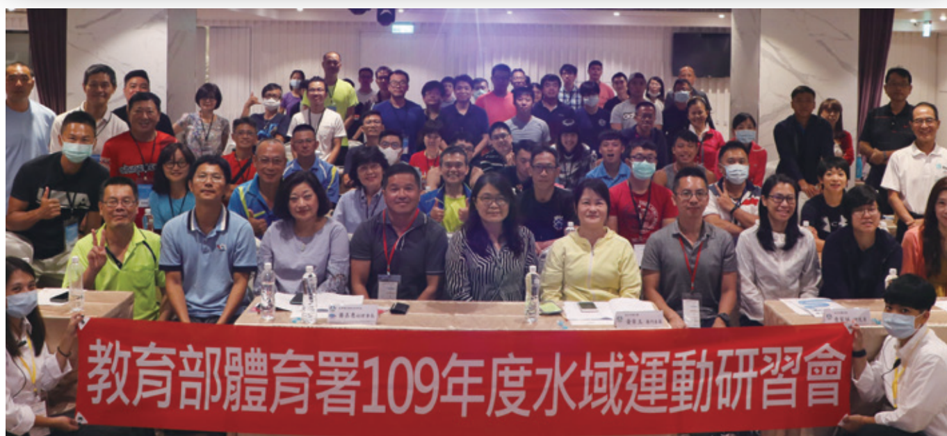
Sports Administration holds the 2020 Water Sports Workshop